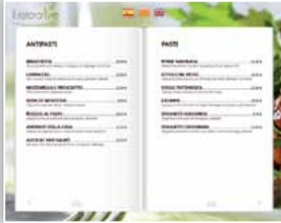
eMenu main screen

Electronic touch menu in different languages