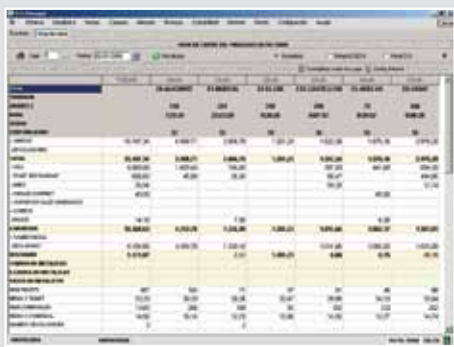
Cash closing of your establishments