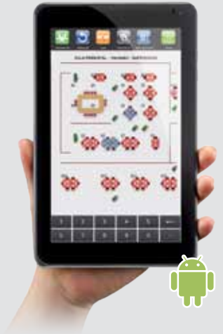
Table status screen in a 7" Tablet

Improves the customer service, prevents possible mistakes and all sales are collected.