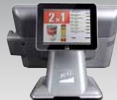
Second Screen/ Customer Display

Advertising, offers and other promotions