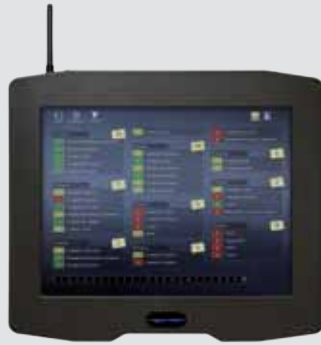
With HioScreen you can control dishes pending to be prepared and served, as well as the time spent from the request