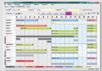
Screenshot of the ICGPlanner daily schedule

Compare the schedule with the employees presence control.